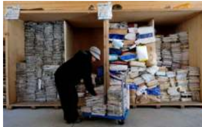
Stacks of newspapers is separated from papers

The town of Kamikatsu adopted a “zero waste” policy in 2003. Before that, the town used to burn all its trash in incinerators.