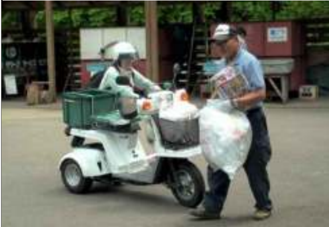
Kamikatsu Residents bring their waste to the recycling plant

types in 13 categories in 2015. For example, metals are sorted into five types, plastics into six types, and paper into nine types. Only a very few kinds of waste are incinerated, including such materials as PVC or rubber, as well as disposable diapers and feminine hygiene products.