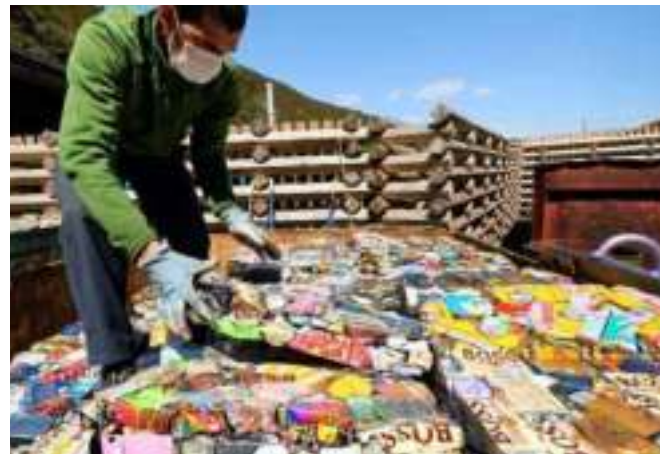
Cans are crushed into space-efficient blocks of aluminum.

There's no garbage truck service there. Almost everyone has to bring their trash into the waste collection center, and only about 20% ends