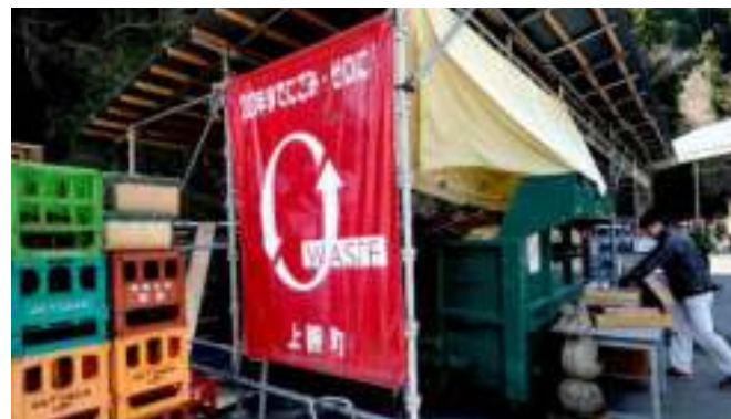
Kamikatsu's waste station

In 2018, Japan's government unveiled a proposal to tackle plastic waste, with the goal of reducing the 9.4 million