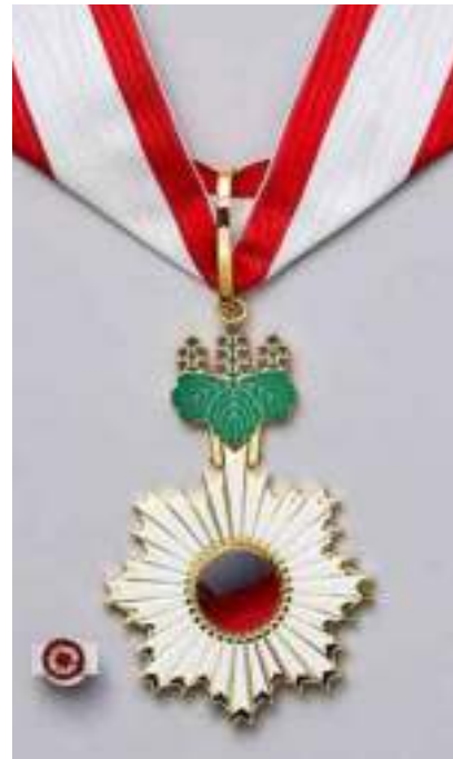
The Order of the Rising Sun, Gold Rays with Neck Ribbon

“ He had close liaison with PJBF's counterpart, Japan Pakistan Business Cooperation Committee (JPBCC), presently headed by the Chairman of Marubeni Corporation of Japan ”