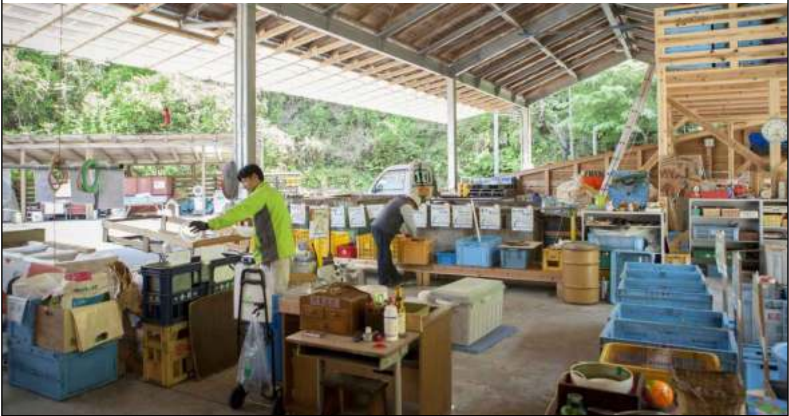
The sheer inconvenience makes people think twice about what they buy.

Kamikatsu’s Waste Station is a center for interaction across the region and a model that is gaining interest from around the