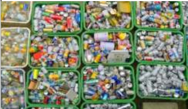
Sorting boxes are lined according to resource type.

Well beyond this small town, people are recognising that reducing what you throw out could be a big step in the global battle against climate change. People get used to the new way of doing things and change their customs, “Once custom is changed, it becomes habit,”